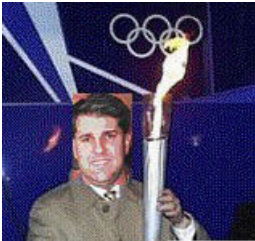
H.D.A. Sep. 2003

For further information concerning this issue go to www.nwi.org